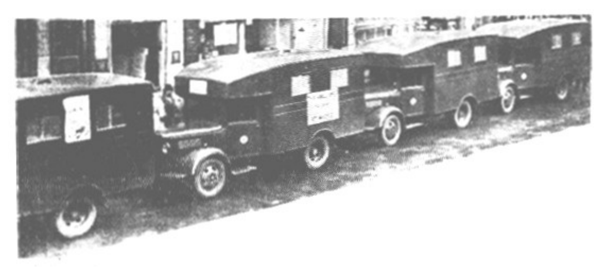
Four ambulances including the ones from Wandsworth and Battersea lined up in New Oxford Street ready for departure to Spain in February 1937.