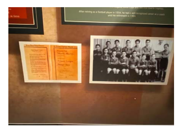
Some images of the exhibition at the San Mamés stadium