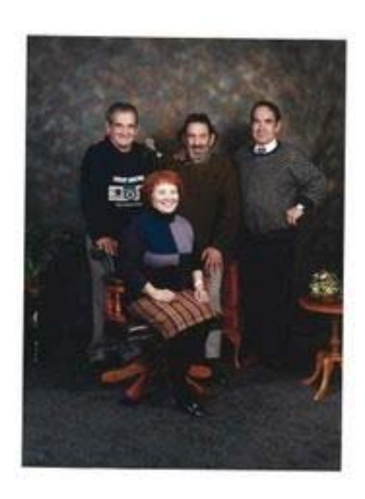
Dad with brother and mum