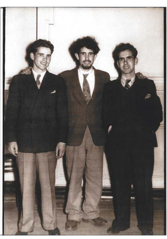
Dad and two brothers