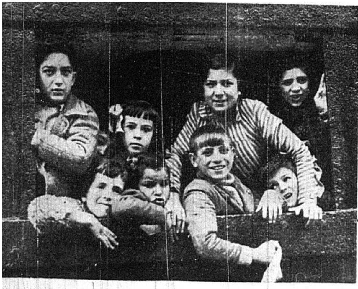
Seeing England as the ship came along side.

The Habana finally left Bilbao at 6.40am 21 May, in the pouring rain, with crowds waiting to see her go. Having said goodbye to their families the night before, seven special trains had brought the children to the dockside to go straight onto the liner. "Children were everywhere, huddled on the floors, in nooks and corners, sleeping peacefully on pillows and mattresses in passages and saloons, or peeping their tousled heads through portholes and railings. Some ... were scampering excitedly up and down the ship, playing hide and seek, or exploring the novelties of an ocean liner." (Southern Daily Echo 21 May 1937) The Basque President, Jose Antonio Aguirrre y Lecube, went on board to say goodbye. Southern Daily Echo, 24 May 1937