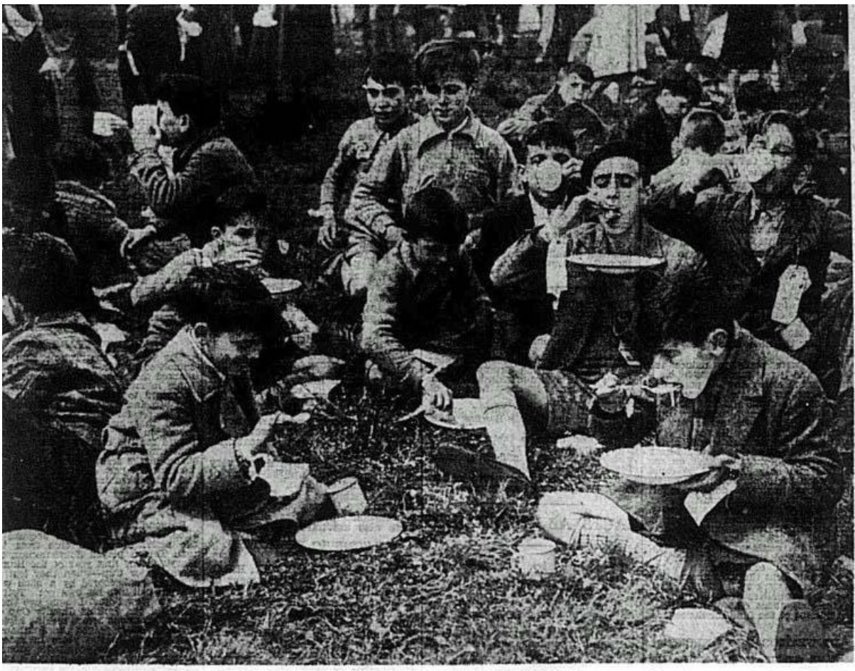
A study in expressions over the mid-day meal at the Basque children's camp at Stoneham.

Feeding the multitude. Volunteers remembered the heaps of washing up.